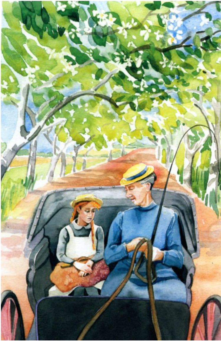
Marilla suddenly felt very sorry for Anne.

Matthew didn't say anything, but he looked very sad. Later, he got the horse and buggy ready for Marilla. Marilla drove, and Anne sat next to her.