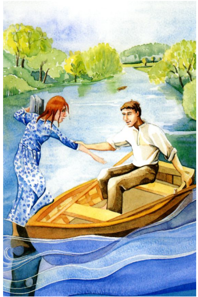
Gilbert gave Anne his hand and pulled her into his boat.

"I'll go to town tomorrow and get new glasses," she thought.