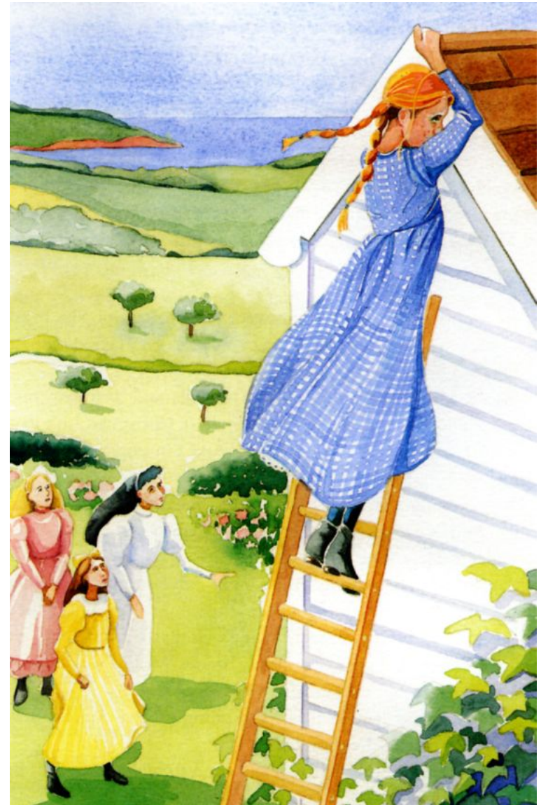
"Stop, Anne!" called Diana.

Anne opened her eyes. Her face was very white. "No, I'm not dead, Diana," she said. "But my leg hurts. I can't walk."