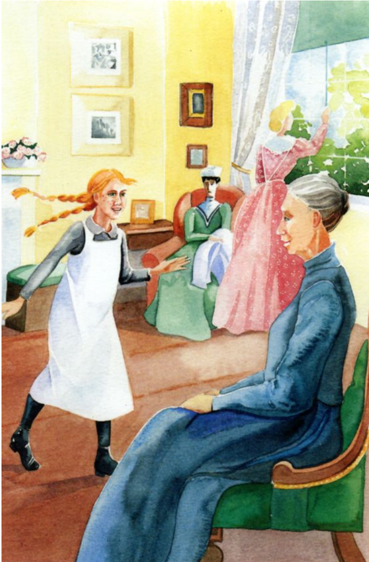
"Can I really stay with you at Green Gables?"

But I have an idea. My neighbor, Mrs. Blewett, has a new baby. She wants a girl to help her. Anne can go and live with her."