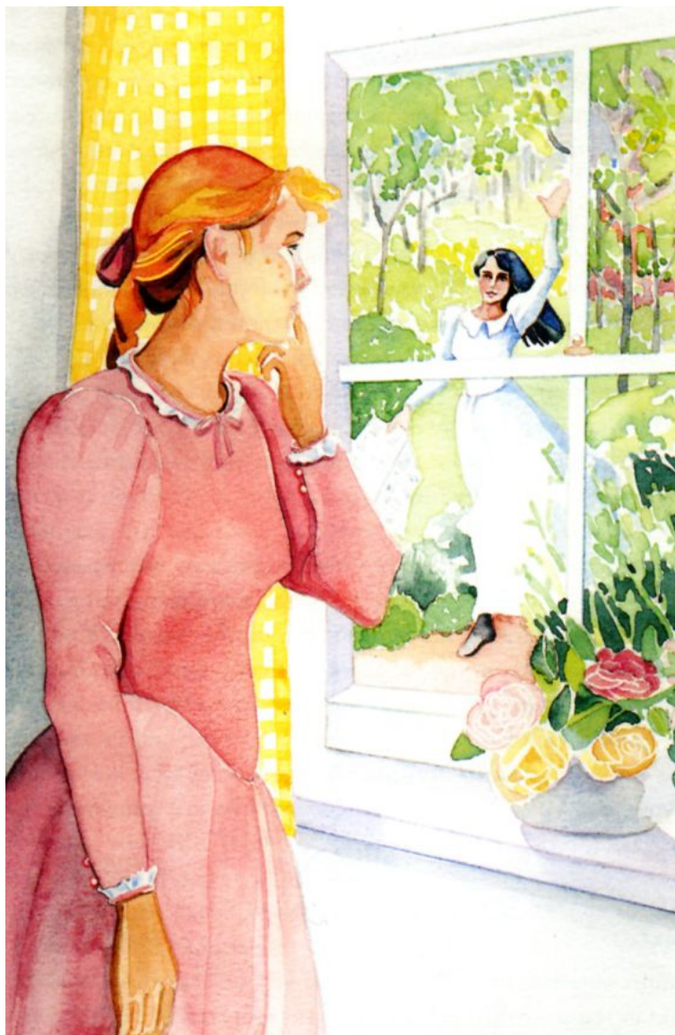
"Your name's in the newspaper."

Anne went back to Green Gables in June. Diana came to see her.