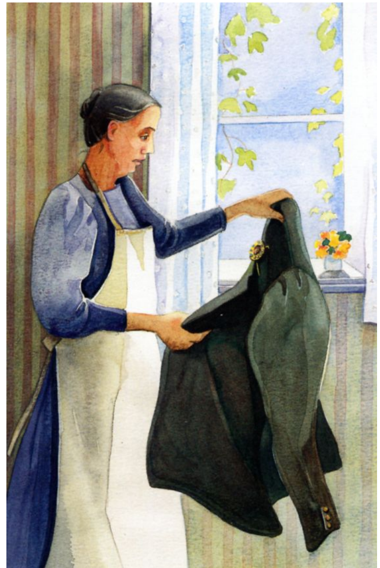
Then Marilla saw something on her coat.

When Anne came home that evening, she was very happy. "Oh, Marilla, the party was wonderful!" she said.