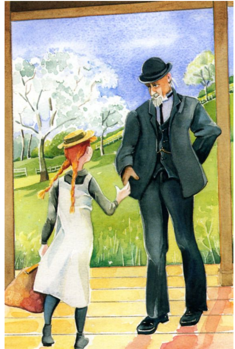
"Are you Mr. Matthew Cuthbert of Green Gables?"

The girl got into the buggy and Matthew drove home. The child talked and talked. Matthew listened. He was a quiet man