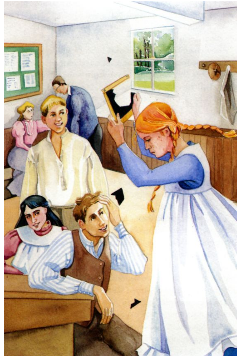
Anne hit Gilbert on the head with her slate and the slate broke.

Anne jumped to her feet and looked at Gilbert angrily. "I hate you!" she cried. "I hate you!" She hit Gilbert on the head with her slate and the slate broke. Everybody looked at her.