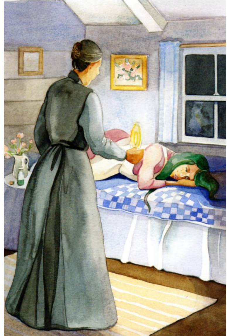
Marilla looked at Anne's hair. It was green!

Anne climbed into the bottom of the boat. The girls put flowers into her hands and Anne closed her eyes.