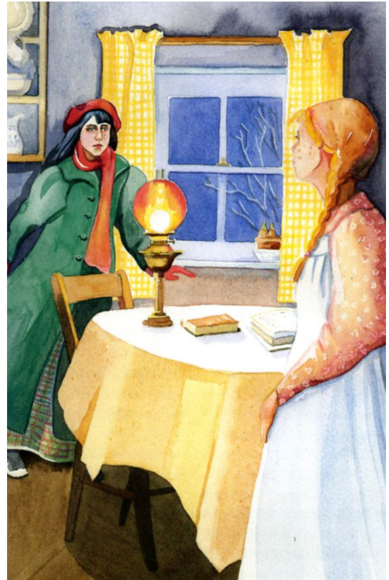
Suddenly, Diana ran through the door.

Matthew arrived with the doctor. "I'm sorry we're late," he said. "The doctor wasn't at home. I had to wait for a long time."